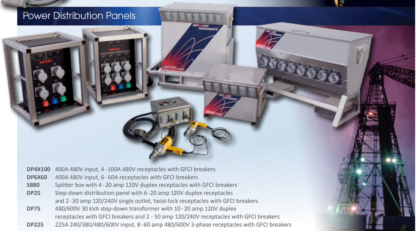
Power Distribution Panels

We rent diesel-powered electric generators that can supply up to 350 kW (440 kVA) of temporary power for welding equipment, electric-power-distribution panels and other shipyard electric-power requirements.