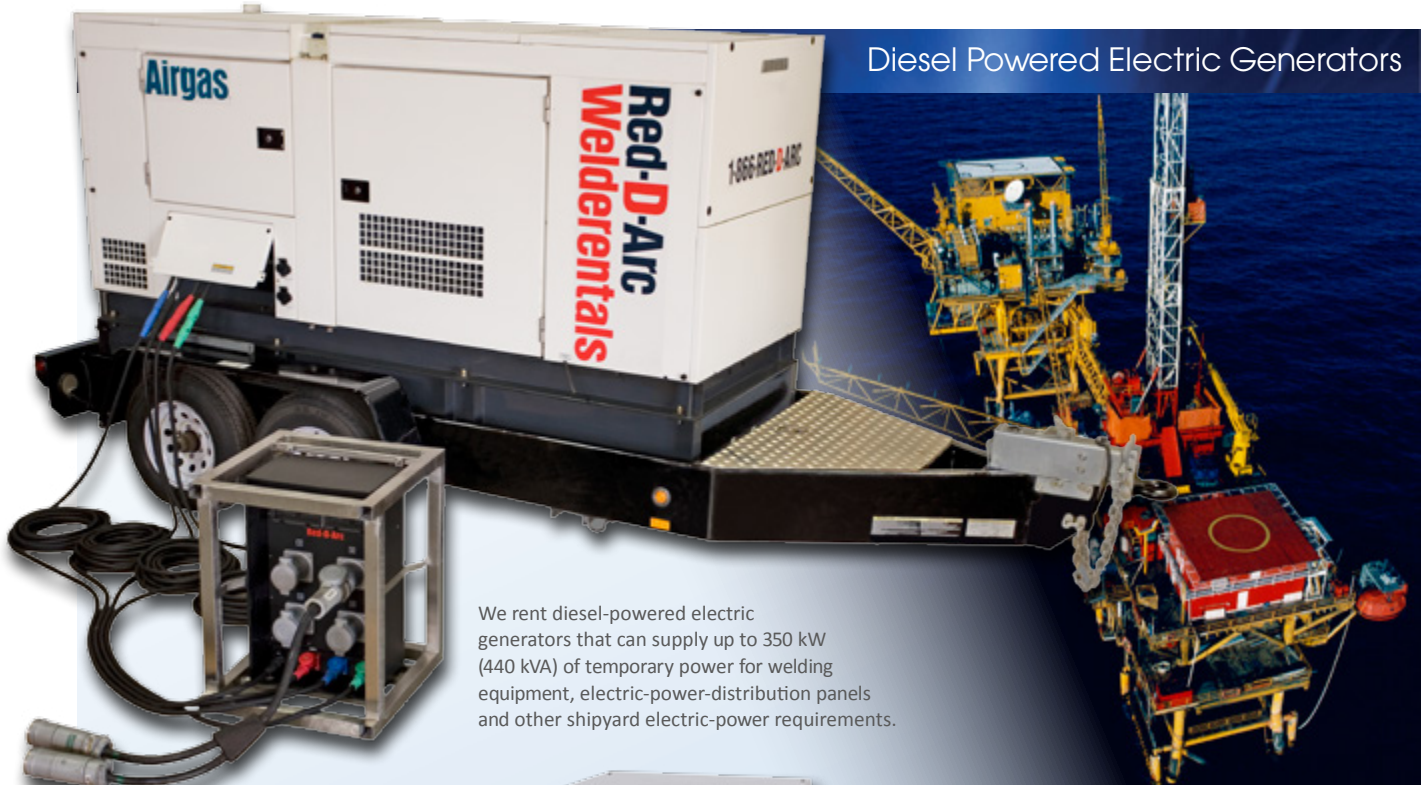
Diesel Powered Electric Generators

Welding and Power Solutions For Oil Refineries and Petrochemical Plants