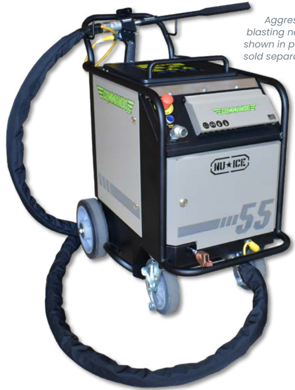
Aggressive blasting nozzle shown in photo sold separately

The COMMANDO® 55 Dry Ice Blaster is a powerful pneumatic and electric cleaning machine built to take on even the most challenging cleaning applications. Ideal for heavy duty cleaning and commercial cleaning service applications, the COMMANDO® 55 features a larger 55 lbs (25 kg) hopper, the BlitzFeed® freezeless dry ice delivery system and an increased air flow capacity for maximum blasting velocity.