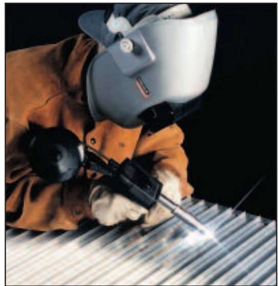
The Magnum® SG Spool Gun is an excellent choice for aluminum sheet metal welding.